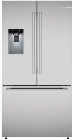
B36FD52SNS Stainless Steel