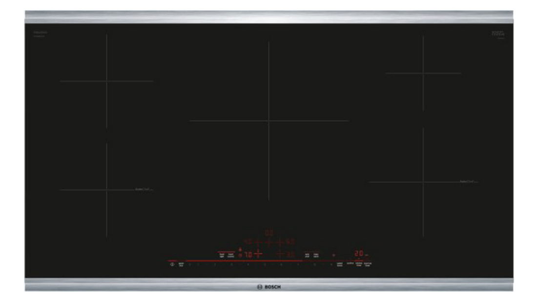
NIT8660SUC* - 36"