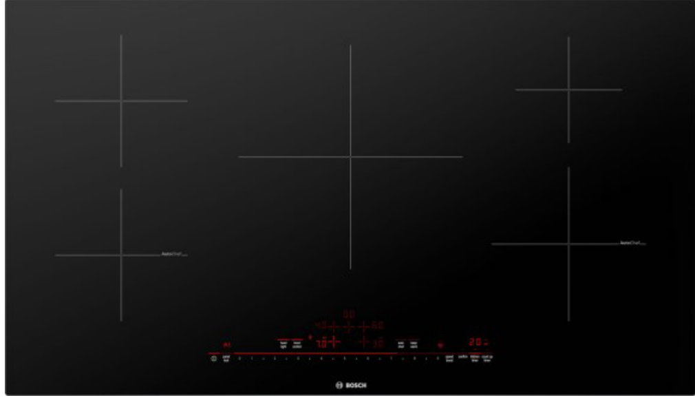
NIT8660UC - 36"