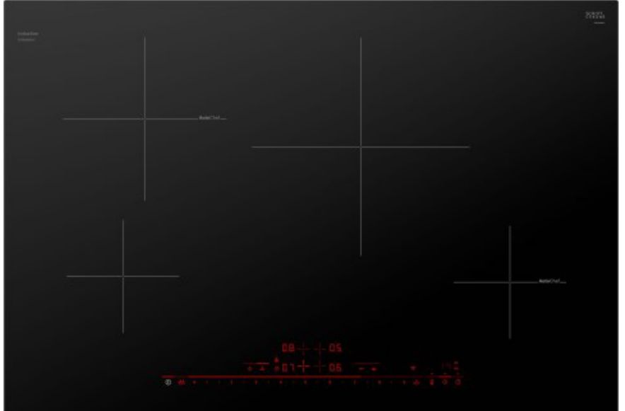
NIT8060UC - 30"