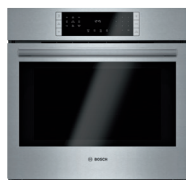
HBL8453UC 30" Stainless Steel