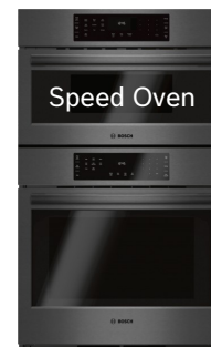
Black Stainless (Speed Oven): HBL8743UC