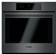
HBL8443UC 30" Black SS