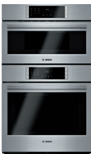
HBL8753UC 30" Stainless Steel