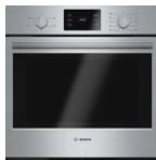
30" Thermal Only: HBL5351UC