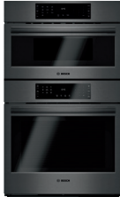
HBL8743UC 30" Black SS