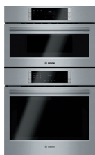
HBL87M53UC 30" Stainless Steel