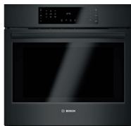
HBL8463UC 30" Black