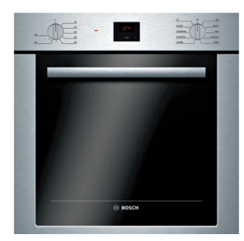
HBE5453UC Stainless Steel

The 24" Bosch Wall Oven features Genuine European Convection and is Designed for Kitchens with a Smaller Footprint