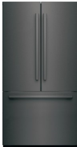
French Door Bottom Mount Counter Depth B21CT80SNB