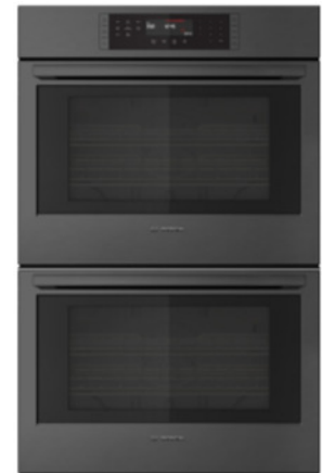
Double Oven HBL8642UC