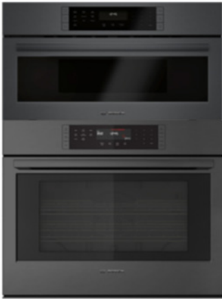
Combo Oven w/Speed HBL8742UC