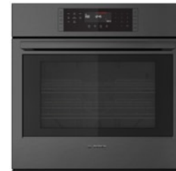
Wall Oven HBL8442UC