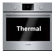
30" Thermal – 500 Series HBL5351UC (472475) $1,699