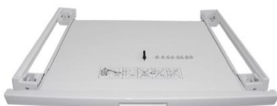
Pull Out Tray Stacking Kit WTZ11400 (543785)