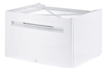
Washer Pedestal: WMZ20490 (286971) Dryer Pedestal: WMZ20500 (425720)

For any additional questions on 24" laundry, please contact our product specialists through our sales support website: www.askboschlowes.com Live Chat: Mon-Fri 8:30AM to 6:00PM EST Outside of chat hours? Submit a question and receive a response within 24 Hours.