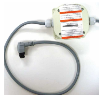
Factory Provided: Junction Box - Hardwire Applications