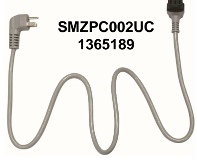
Accessory not included: 3-Prong Cord – Direct Plug-in Applications