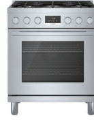
HDS8055U 30" 5-Burner Stainless Steel