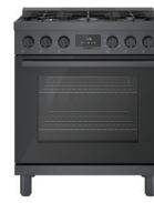
HDS8045U 30" 5-Burner Black Stainless Steel