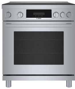
HIS8055U 30" Induction, 4 Elements Stainless Steel

Text "Industrial" to 21432 to learn more.*