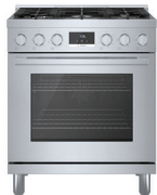
HGS8055UC 30" 5-Burner Stainless Steel