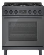
HGS8045UC 30" 5-Burner Black Stainless Steel