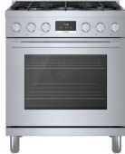
HDS8055U 30" 5-Burner Stainless Steel