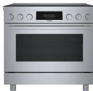
HIS8655U 36" Induction, 5 Elements Stainless Steel

Inclined Digital Display for easy viewing