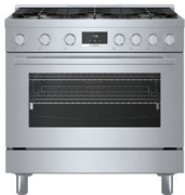
HGS8655UC 36" 6-Burner Stainless Steel