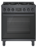
HDS8045U 30" 5-Burner Black Stainless Steel