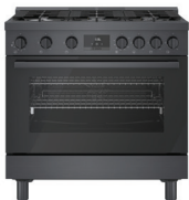
HGS8645UC 36" 6-Burner Black Stainless Steel