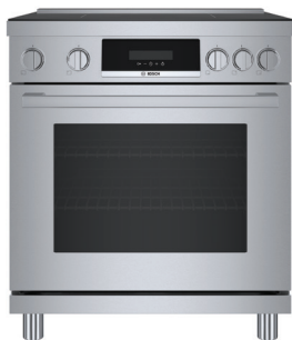
HIS8055U 30" Induction, 4 Elements Stainless Steel

Text "Industrial" to 21432 to learn more.*