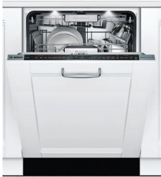
SHV88PZ63N Custom Panel

Patented CrystalDry™ technology transforms moisture into heat to get dishes, including plastics, 60% drier.+