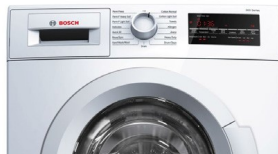
300 Series WAT28400UC