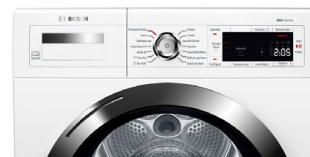
800 Series with Home Connect™ WTG865H3UC