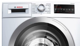
500 Series WAT28401UC