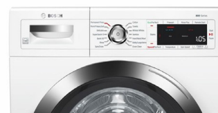
800 Series with Home Connect™ WAW285H2UC