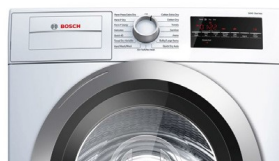
500 Series WTG86401UC