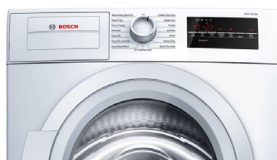
300 Series WTG86400UC