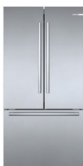
3 Door Stainless Steel Bar Handle B36CT80SNS