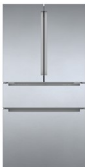
4 Door Stainless Steel Recessed Handle B36CL80ENS