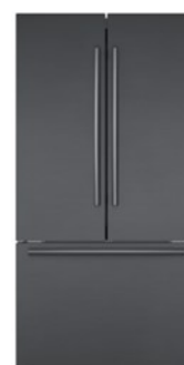
3 Door Black Stainless Steel Bar Handle B36CT80SNB