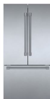
3 Door Stainless Steel PRO Handle B36CT81SNS