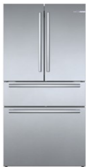
4 Door Stainless Steel Bar Handle B36CL80SNS

Introducing the revolutionary, new Bosch counter-depth refrigerators, with a streamlined interior and advanced freshness system that keeps the ingredients you love fresher longer. Enjoy less food waste, and more thoughtful design.