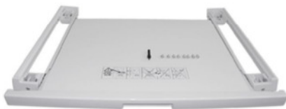
Pull Out Tray Stacking Kit WTZ11400