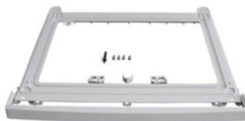
Regular Stacking Kit WTZ20410