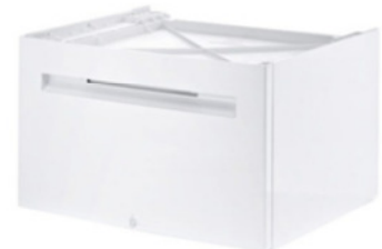
Washer Pedestal: WMZ20490 Dryer Pedestal: WMZ20500

For more information on the entire line of 24" Compact Laundry, visit www.AskBoschLowe.com .