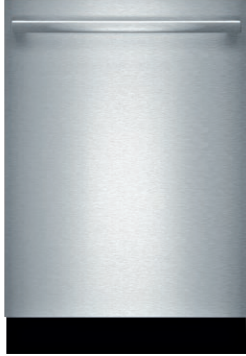
SHX5AVF5UC Stainless Steel