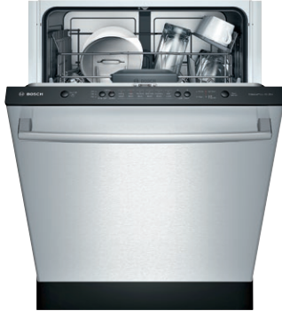
SHX3AR75UC Stainless Steel