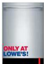
Model shown: SHX4ATF5UC/498130

Find a complete dishwasher assortment on Lowe.com/Bosch .