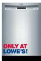
Model shown: SHE53TF5UC/498131