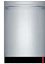
Model shown: SHX68T55UC/498135