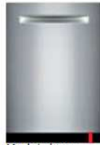
Model shown: SHP65T55UC/498132