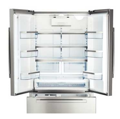
Counter-Depth French Door B22CT80SNS (594062)