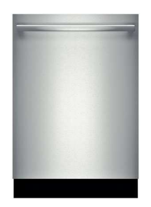
Bar Handle Dishwasher SHX68T55UC (498135)