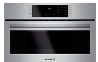
Speed Microwave Oven HMC80151UC (593693)