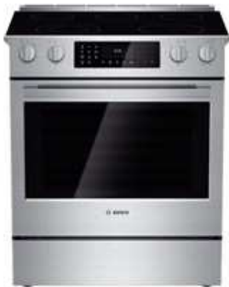
Electric HEI8054UC (472505)

Love a sleek, built-in look but only have room for a range? Replace your freestanding range to a slide-in range without changing cabinetry or countertops. These sleek, full-depth ranges optimize counter space, offering five burners, ovens with European convection and a convenient warming drawer.