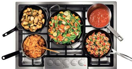
Gas NGM8055UC (604895)