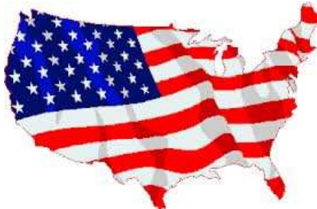
Manufacturing in the USA