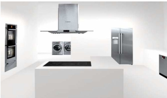
European Design, Clean Lines, Invented for Life