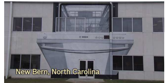
New Bern, North Carolina