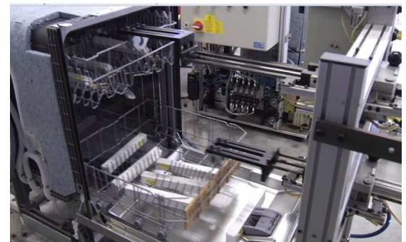
Every Product Quality Control Tested